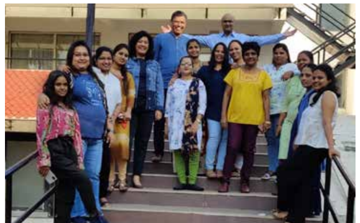
The Team in India