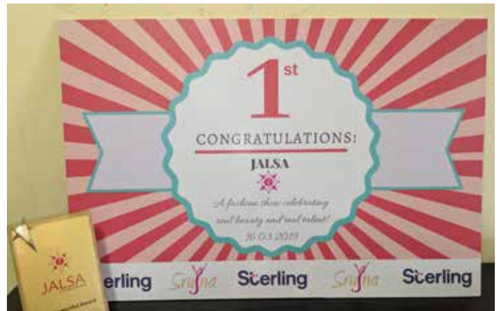
Fashion Show Award